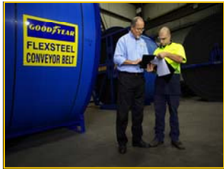
Veyance staff discussing training options

Reforms to the Victorian Vocational Education and Training system are encouraging businesses with good staff training practices, like conveyor belt manufacturer, Veyance Belting.